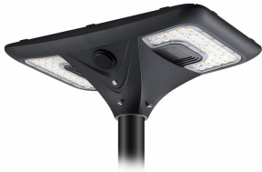
Solar All-in-one Post top