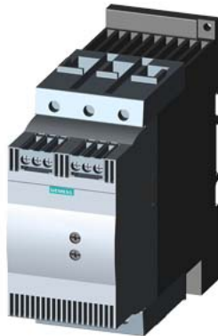
SIRIUS soft starter S3 106 A, 55 kW/400 V, 40 °C 200-480 V AC, 24 V AC/DC Screw terminals