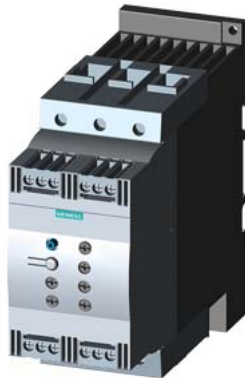
SIRIUS soft starter S3 80 A, 45 kW/400 V, 40 °C 200-480 V AC, 110-230 V AC/DC Screw terminals