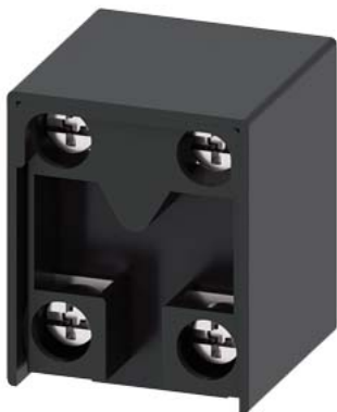
Contact block for position switch 3SE51/52 1 NO/1 NC quick action contact